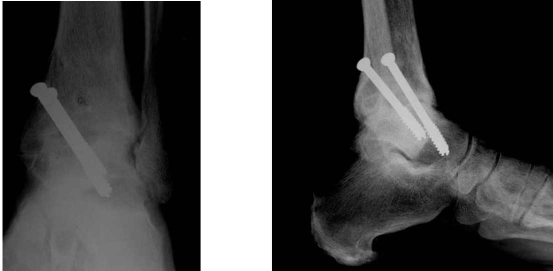
X rays of the ankle after successful fusion.

Most problems can be treated by medications, therapy and on occasions by further surgery, but even allowing for these, sometimes a poor result ensues.